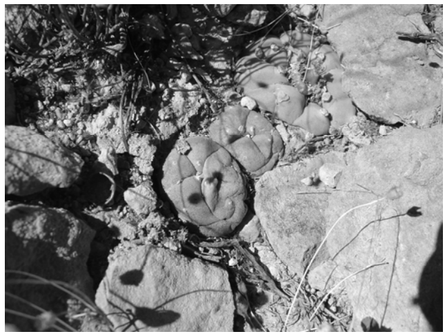
Fig. 1. Typical healthy specimens of Lophophora williamsii in habitat in Presidio County, Texas.