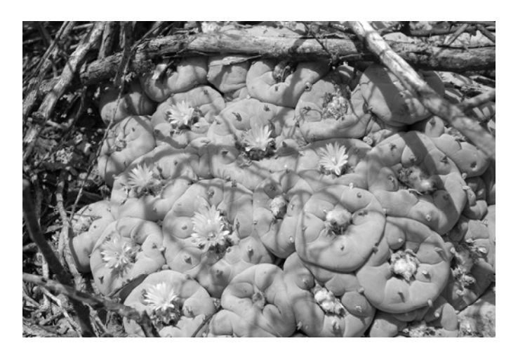
Fig. 6. A typical clump of L. diffusa growing near a dry creekbed in Querétaro, Mexico.