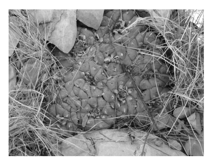
Fig. 9. A clump of L. williamsii growing in Terrell County, Texas. The question goes begging as to whether it is a cespitose individual or a pseudocespitose cluster of individuals.

Note: The photographs for Figures 1-9 can be viewed in color at: <u>http://www.cactusconservation.org/CCI/Lwfreezedry.html</u>