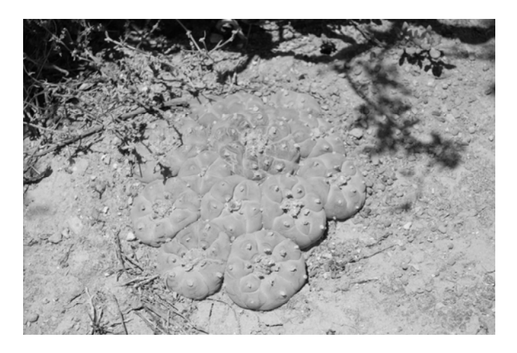
Fig. 8. A relatively small clump of L. williamsii growing at El Huizache, in San Luis Potosí, Mexico.