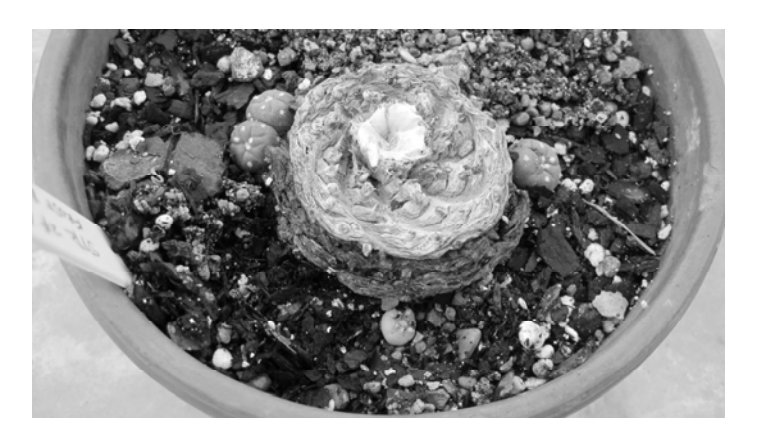
Fig. 3. Four new offsets ("pups") that emerged after transplanting the specimen shown in Fig. 1 to a pot in the greenhouse and providing water for 11 weeks. The emergence of offsets indicates that the plant is alive but its apical meristem is dead.