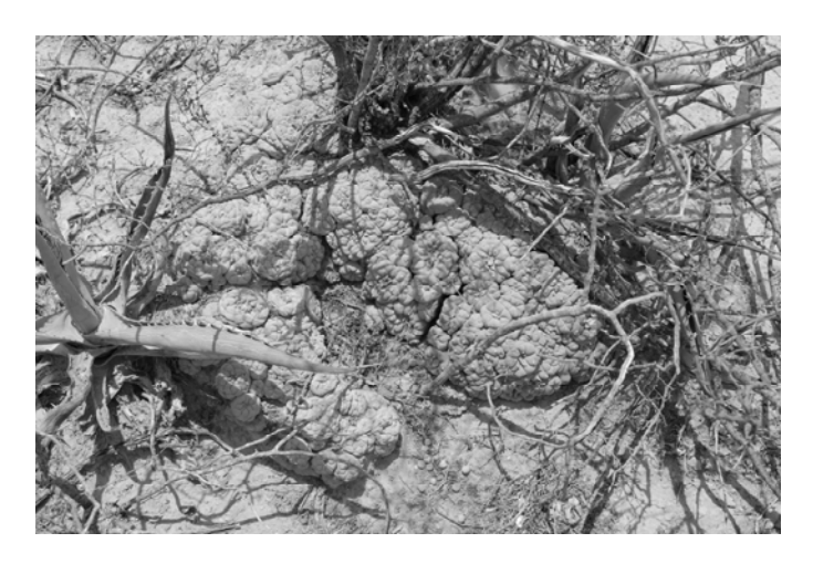
Fig. 5. A large clump of L. fricii growing in the Laguna de Viesca in Coahuila, Mexico.