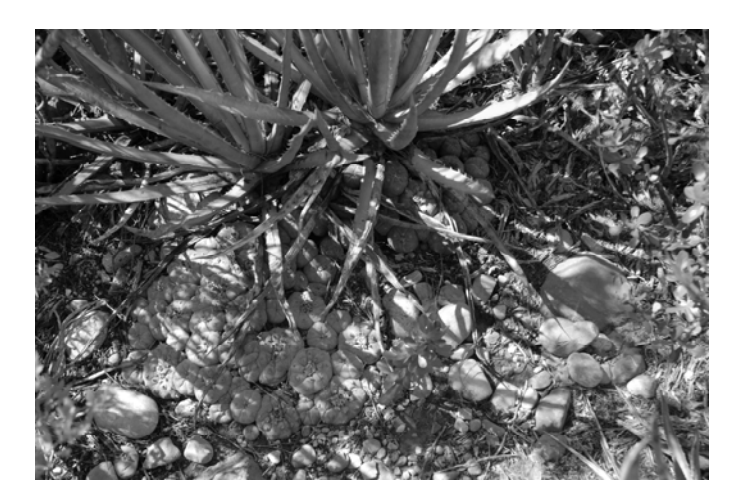
Fig. 7. A clump of L. williamsii growing west of Miquihuana in southern Tamaulipas, Mexico.